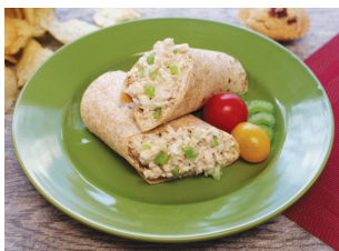
Mom's Chicken Salad Wrap

Includes Healthy Chips and CFH Famous Assorted Desserts